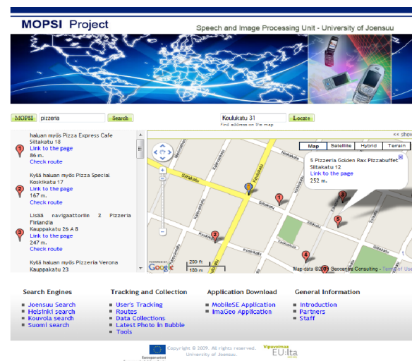
Figure 1: The web interface of the MOPSI search engine.

We introduce an alternative solution referred to as location-based search engine based on the ideas in [3] with the following practical solutions. For a given location (e.g. from GPS), we perform location-restricted web query, analyze the web-pages found (relevant by keyword), extract potential address information and compare them to the entries in a gazetteer. Positive results are presented according to their distance relative to the user location, plotting the target location on map or giving navigational information to the location.