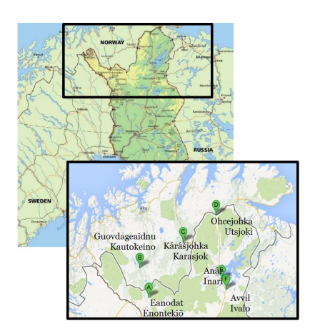
Figure 1: Map of Northern Europe, with the inset showing the data collection sites for this study.

rently there are about 30.000-40.000 Sami speakers, but some Sami languages have already disappeared and some have only a few speakers left [18, 19]. North Sami is the biggest and most widely spoken of the Sami languages, with about 20,000 Sami speakers. It has become a kind of lingua franca among the Sami speakers, used e.g. in news broadcasting.